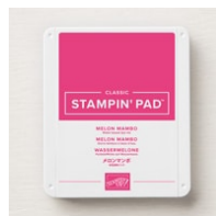
Melon Mambo Classic Stampin' Pad [147051] $7.50