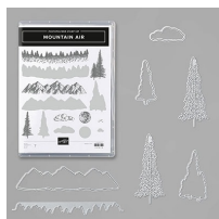
Mountain Air Bundle [153820] $50.25