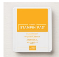
Mango Melody Classic Stampin' Pad [147093] $7.50