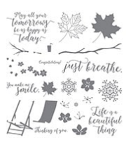
Colorful Seasons Photopolymer Stamp Set [143726] $27.00