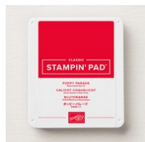
Poppy Parade Classic Stampin' Pad [147050] $7.50