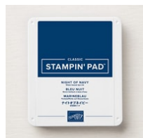
Night Of Navy Classic Stampin' Pad [147110] $7.50