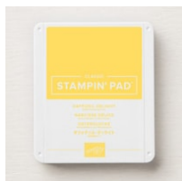
Daffodil Delight Classic Stampin' Pad [147094] $7.50