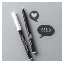
White Stampin' Chalk Marker [132133] $3.50