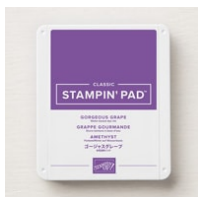
Gorgeous Grape Classic Stampin' Pad [147099] $7.50