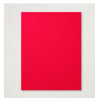
Poppy Parade 8-1/2" X 11" Cardstock [119793] $8.75