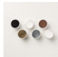
Black Stampin' Emboss Powder [146956] $5.00