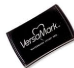
VersaMark Pad [102283] $9.50