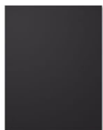
Basic Black 8-1/2" X 11" Cardstock [121045] $8.75