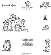
The Gang's All Meer Cling Stamp Set (English) [152294]