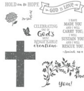
Hold On To Hope Cling-Mount Stamp Set [151243]