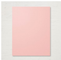
Blushing Bride 8-1/2" X 11" Cardstock [131198]