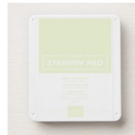
Soft Sea Foam Classic Stampin' Pad [147102]