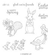
Fable Friends Cling Stamp Set [148670]