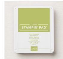
Pear Pizzazz Classic Stampin' Pad [147104]