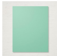
Coastal Cabana 8-1/2" X 11" Cardstock [131297]