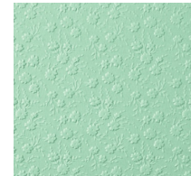
Ornate Floral 3D Embossing Folder [152725]