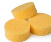
Stamping Sponges [141337]