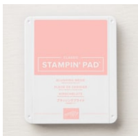
Blushing Bride Classic Stampin' Pad [147100]