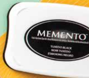
[ AC P. 147 ] MEMENTO™ INK PAD 132708 $6.00