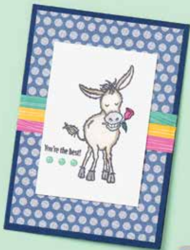
[ AC P. 158 ] 2020–2022 IN COLOR™ ENAMEL DOTS 152480 $8.00