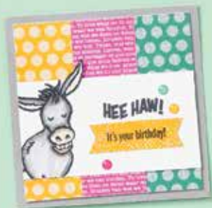
[ AC P. 144 ] 8-1/2" X 11" CARDSTOCK ASSORTMENT Neutrals • 146977 $9.00