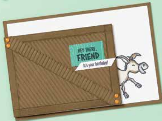
[ AC P. 142 ] STAMPIN' BLENDS™ COMBO PACK O Crumb Cake • 154882 $9.00 O Smoky Slate • 154904 $9.00